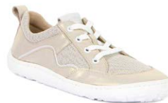
GOLD SHINE * G3130258-3