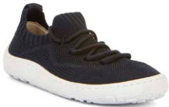
DARK BLUE G3130262