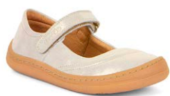
GOLD SHINE G3140184-5