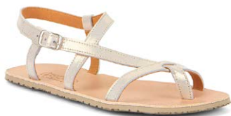
GOLD SHINE G3150269-4