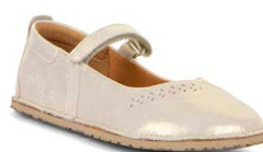
GOLD SHINE G3140189-1