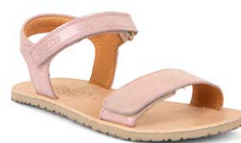
PINK SHINE G3150264-8