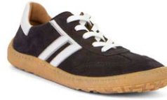
DARK BLUE * G3130268