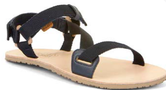
DARK BLUE G3150284-1