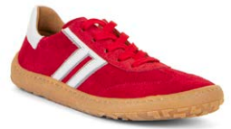
RED * G3130268-1