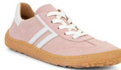
PINK * G3130268-2