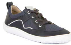
DARK BLUE G3130258-2