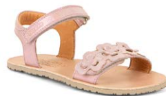
PINK SHINE G3150265-5