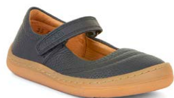
DARK BLUE G3140184