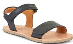
DARK BLUE G3150264-7