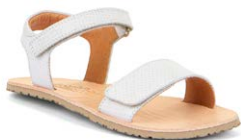
WHITE SHINE G3150264-20