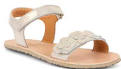
GOLD SHINE G3150265-6