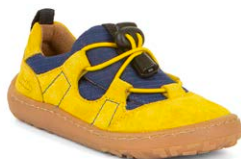
BLUE ELECTRIC+ G3130243-3