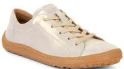
GOLD SHINE * G3130242-6