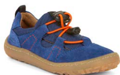
BLUE ELECTRIC G3130243