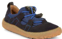
DARK BLUE G3130243-1