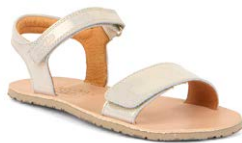
GOLD SHINE G3150264-10