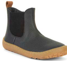
DARK BLUE G3160244