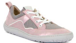
PINK SHINE * G3130258-4