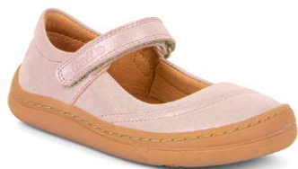
PINK SHINE G3140184-4